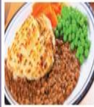
Collage Pie served with Seasonal Vegetables