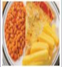
Cheese & Tomato Pizza served with Chips or Peas or Baked Beans

VEGETARIAN VERSIONS OF THE ABOVE MEAL AVAILABLE DAILY