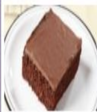
Iced Wacky Chocolate Cake