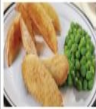
Breaded Chicken Goujons served with Potato Wedges & Seasonal Vegetables