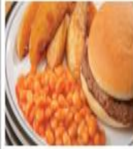
Beef Burger served in a Bun with Potato Wedges & Seasonal Vegetables or Baked Beans