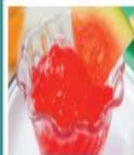
Jelly & Fruit