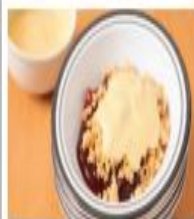
Fruit Crumble & Custard