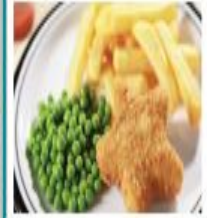
Fish Star (MSC) served with Chips & Peas or Baked Beans

VEGETARIAN VERSIONS OF THE ABOVE MEAL AVAILABLE DAILY